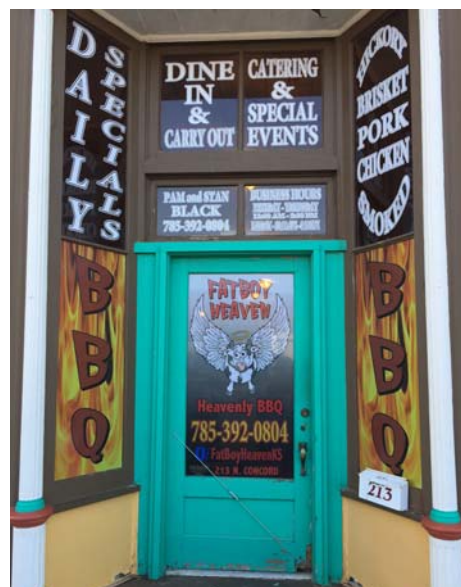
FatBoy Heaven is open at its new location at 213 N. Concord in downtown Minneapolis.