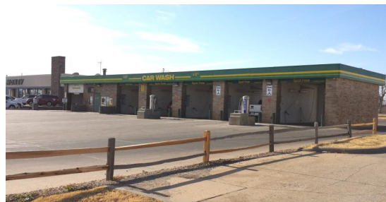
Salinans Craig and Melissa Piercy have owned and operated StuJo's Car Wash since last Fall. Pictured at top is the 120 N. Broadway location and pictured below is the 2200 Planet Avenue location.