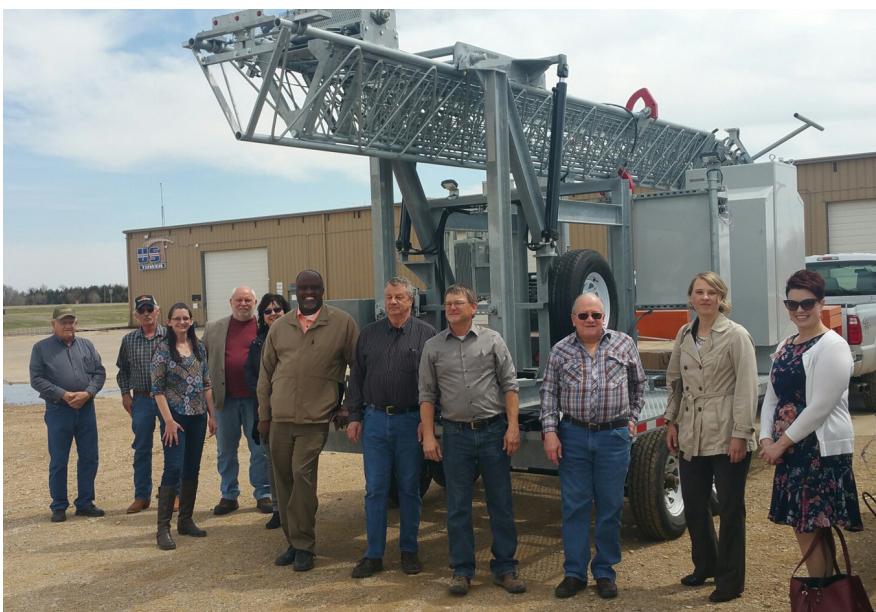
Members of the NCRPC Executive Board continued its annual field trip tradition with a trip to Lincoln County on April 26. The group had lunch and a short business meeting at the Finch Theatre in downtown Lincoln before adjourning for a tour of US Tower.