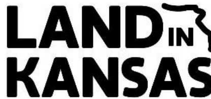
Logo courtesy of Kansas Department of Commerce.

According to Hutchinson, her role is to create a Request for Proposal (RFP) to analyze and audit the Kansas Department of Commerce Development programs and incentives. Three different stakeholder groups—including economic development professionals, business and industry leaders, and legislators—will be consulted to determine what to include in the RFP.