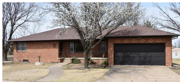
The Wilson State Bank FHLBank JOBS award assisted homebuyers.