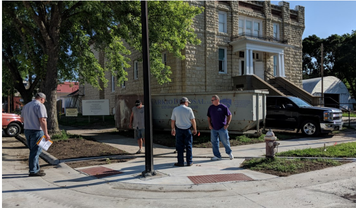
The recent drainage improvement project in the City of Waterville included this intersection near the historic Waterville Opera House.

In the planning process, the city’s governing body and staff worked to review areas of need and prioritize those based on their location and impact to citizens and city maintenance programs. Completion of this project addressed the most problematic areas throughout the city’s drainage system.