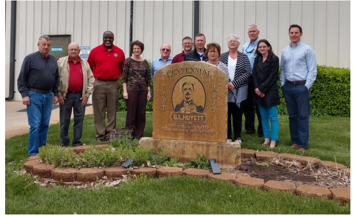
The Executive Board field trip on April 25 included a tour of G.L. Huyett in Minneapolis. Board members also heard from the North Central Kansas Regional Special Response Team that day.

The board also heard from representatives of the North Central Kansas Regional Special Response Team. This highly trained and skilled