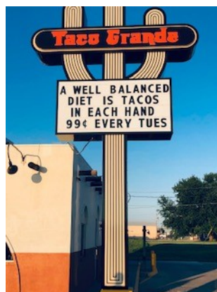
Taco Grande opened in April in Concordia at 1421 E 6th Street.