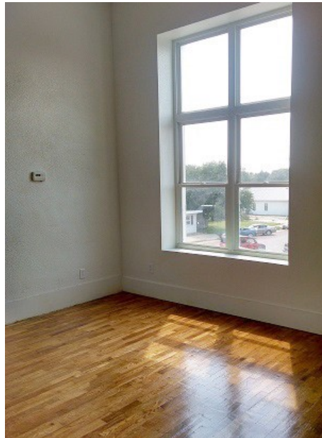
Renovation of four loft apartments in downtown Mankato was included in one of the city's recent housing projects.

“Our work is not complete with housing, but it is certainly going in the right direction,” Koester said. “If you can rehabilitate a house and stop it from going downhill, you keep it a viable housing unit for your