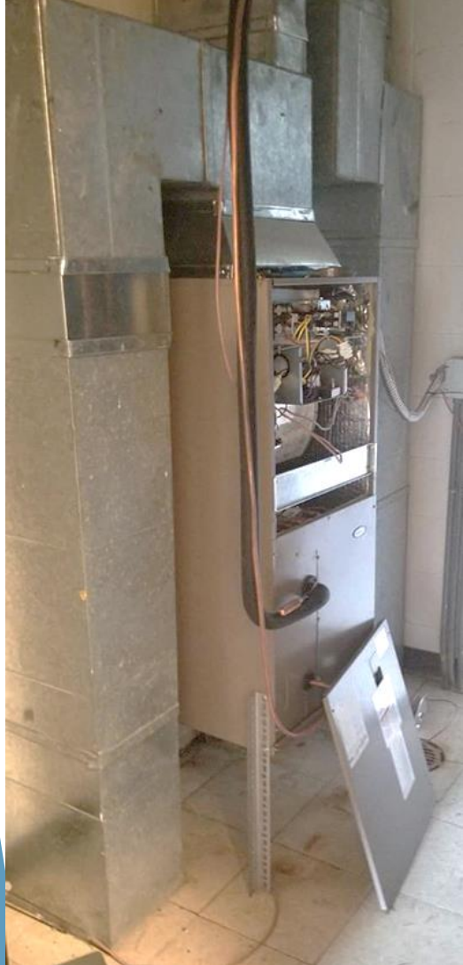
COMMON AREA HEAT PUMP