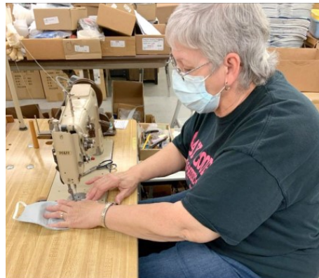
Scott Specialties, Inc., headquartered in Belleville, recently started manufacturing cloth masks.

People have come together in inspiring and innovative ways to help one another thrive during these challenging times. What follows are just some of the examples of how communities have responded to situations created by COVID-19.