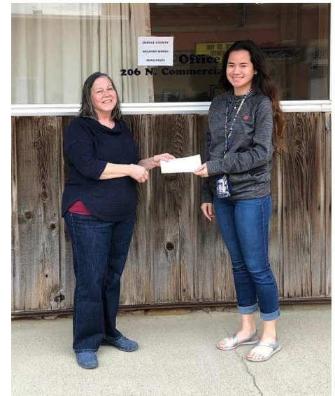
The Rock Hills Jr/Sr High School senior class donated $1,500 to Jewell County Helping Hands Ministries.

initiatives to help fill the needs. Through the Caring for Cloud County program, the Community Foundation for Cloud County donated matching funds to local food pantries through a gift card/ Chamber Bucks program. Concordia Chamber of Commerce, Cloud County