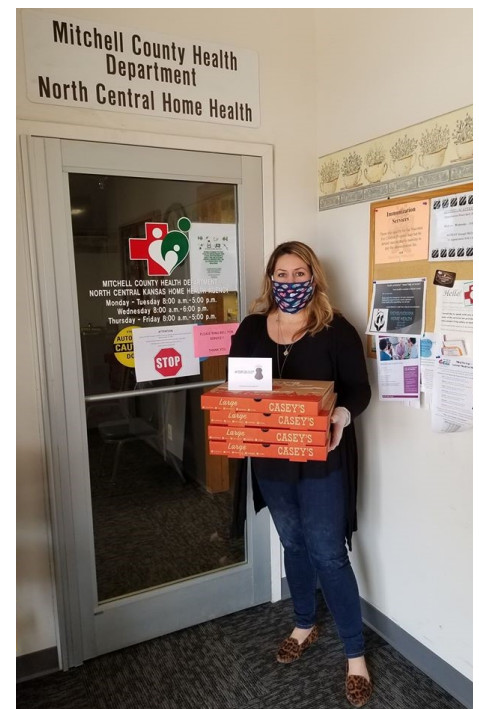
One initiative of Mitchell County Strong is the Hungry Hungry Hero program that was created to help provide lunch once a week for those working on the front lines during the COVID-19 pandemic.

Communities created t-shirts, websites and campaigns quickly and with great success to benefit businesses, individuals and families. Neighbors helping neighbors has always been a foundation of North Central Kansas and its citizens. That spirit will be important as the region recovers.