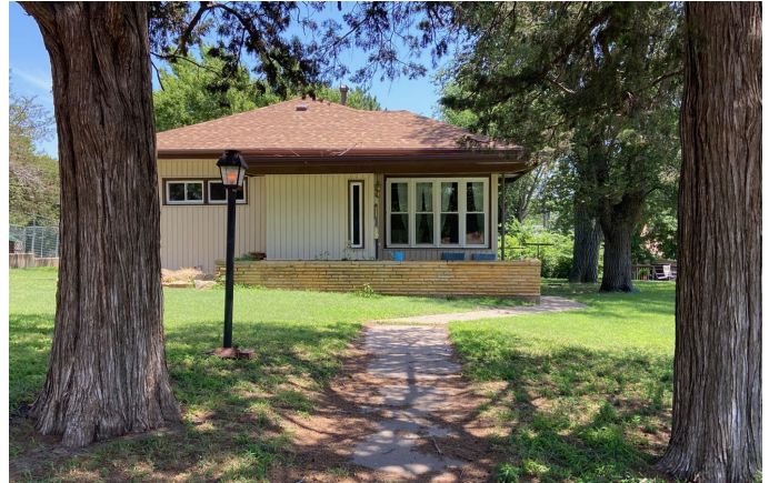
Multiple programs were involved in the recent improvements to this Ellsworth home.