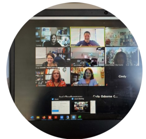
Photo: North Central Kansas Public Health Initiative participants continued to meet and work together using Zoom.

NCRPC continued to work with 13 local health departments through the North Central Kansas Public Health Initiative (NCKPHI) to improve and protect the health of their communities. The NCRPC provides administrative, fiscal and support services through the regional public health emergency preparedness and response grant. COVID tested the plans and mitigation strategies that the NCKPHI prepares for through planning, training and exercise in the event that a pandemic or any disaster occurs.