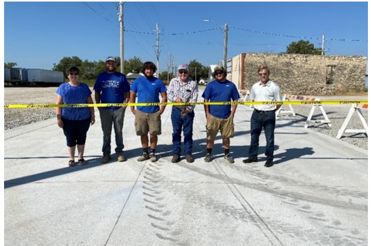
The City of Frankfort completed a project in Fall 2020 that improved one of its existing truck routes. The project was funded through a combination of a CDBG grant and a USDA Rural Development loan.

The resulting project upgraded the existing highly trafficked west truck route to concrete pavement. Corresponding storm sewer, sidewalks and curb and gutter improvements