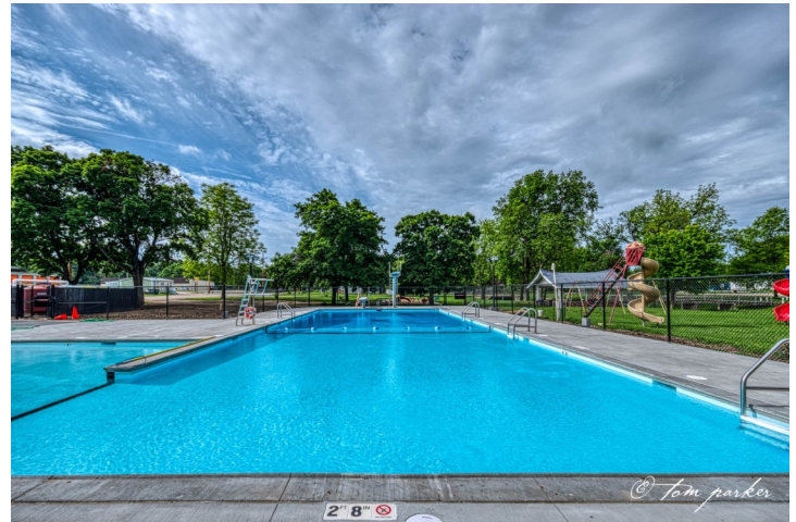
The City of Blue Rapids swimming pool project was completed earlier this year.