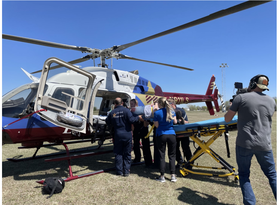
The NCK Technical College Nursing Program hosted NCKTC Disaster Day in Beloit on April 29. The event provided an opportunity for leadership growth and training in North Central Kansas. The North Central Kansas Rural Development Initiative, administered by the NCRPC, provided a financial contribution in support of videography services for the event.

A grant award from the North Central Kansas Rural Development Initiative helped fund the videography. The NCRPC and its affiliate, North Central Kansas Community Network Co. (NCKCN), manage the NCK Rural Development Initiative Program.